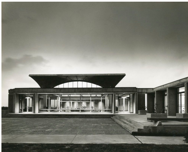
The Wright Brothers National Memorial Visitor Center was designated as a National Historic Landmark in 2001.

On Saturday, October 20 , Wright Brothers National Memorial will hold a grand reopening ceremony for its National Historic Landmark visitor center. The park will be open from 9:00 am until 5:00 pm . Entrance fees will be waived on this very special day.